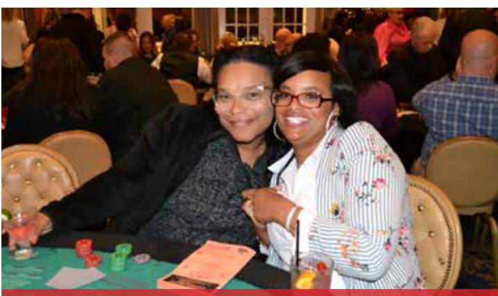
Our 15 <sup>th</sup> Casino Night was held on October 19, 2023, at Eagle Oaks Golf and Country Club, Farmingdale.

To our many supporters, donors, and volunteers, we thank you for helping us sustain and enhance the vital programs and services we provide to more than 3,500 individuals with disabilities.