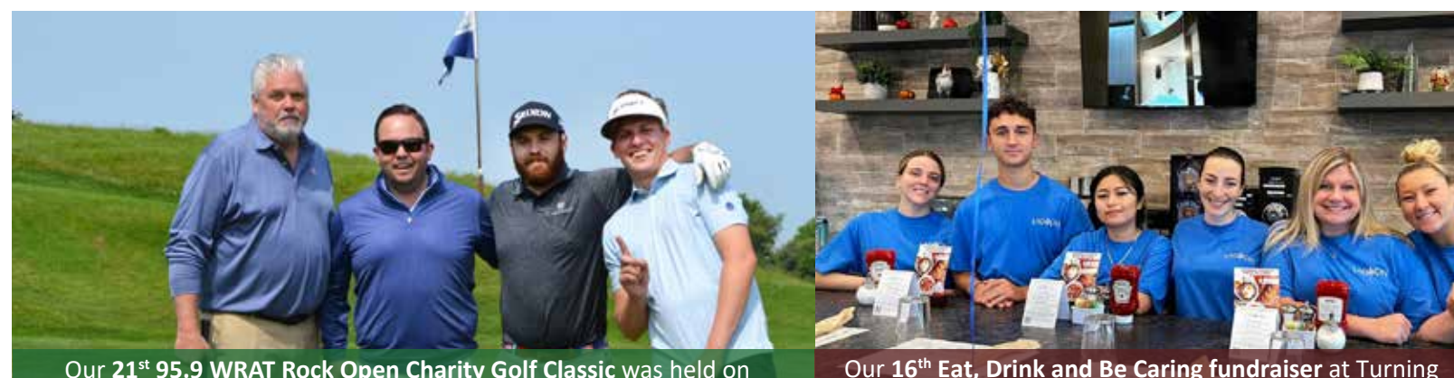
Our 21st 95.9 WRAT Rock Open Charity Golf Classic was held on May 22, 2023, at Jumping Brook Country Club, Neptune.