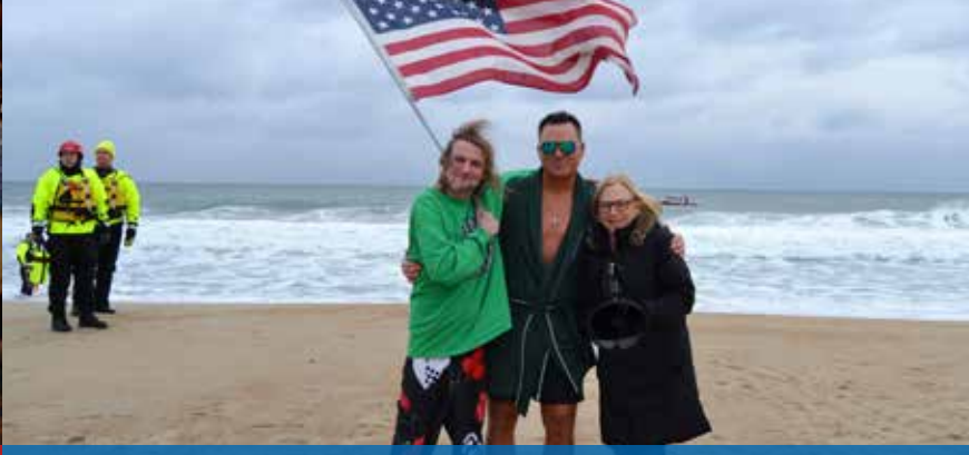
LADACIN's 15th Plunge was held on January 14, 2023, at Manasquan Main Beach.